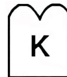
Tablet K Kosher